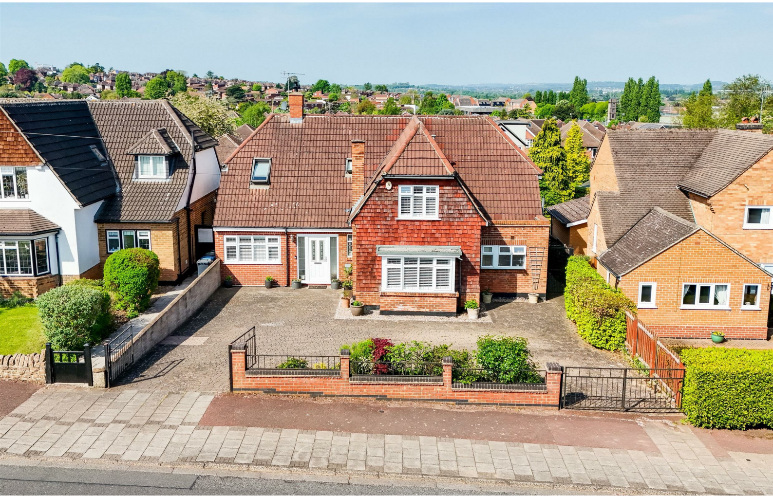
Musters Road, West Bridgford, Nottinghamshire NG2 7DF